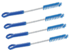
4 x Pipe cleaner - \varnothing 9mm