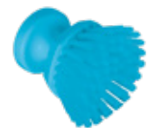
Round brush - \varnothing 110mm