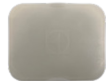
Rubber plug for breading lug