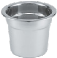
Stainless steel water pan (for ProSift only)