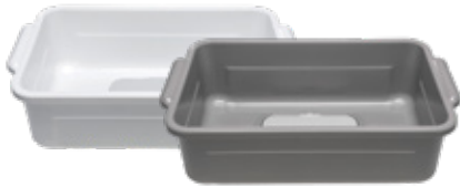
White and grey plastic lug with rubber plug

Get the most out of your breading station with dedicated accessories .