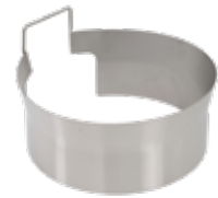
Stainless steel collar for soaking area (for SmartSift only)