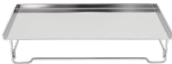
Horizontal tray rack - 30mm length